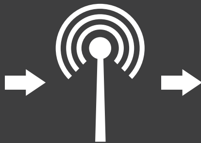
DVB-T2 WIRELESS TRANSMITTER