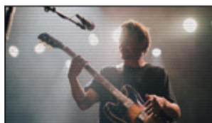
LIVE CONCERT BROADCASTING