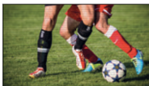
SPORT EVENT BROADCASTING